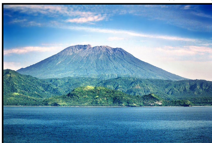
Mount Agung, one of the most picturesque sites in Indonesia, has been showing signs of eruption including consistent plumes of smoke and ash as well as a side of the volcano bulging.

After everything people in Bali have seen they expect the larger eruption to happen soon and have been preparing for it since the first signs of eruption, hoping to have a better outcome than 1963 but that is up to the volcano and the people in the evacuation area.