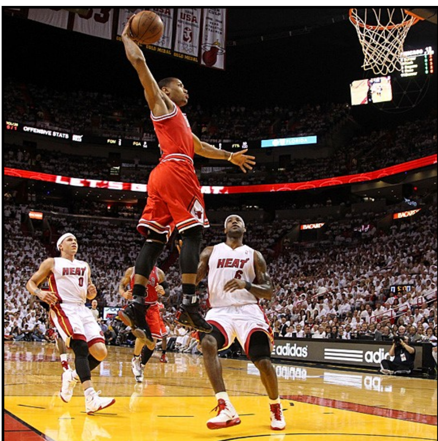
Derrick Rose in his prime took on the Miami Heat in a poster dunk moment.

The impeachment clauses involved obstruction of justice after firing FBI Director James Comey and violating emoluments clauses which prohibit the president from receiving gifts from foreign countries and from profiting while in office. The final accusation is that Trump has undermined the nation's press and courts which threatens our nations democracy.